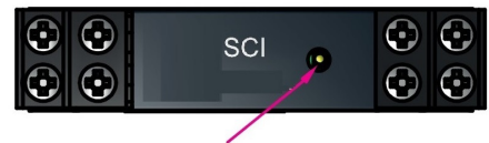
Short Circuit Indicating LED